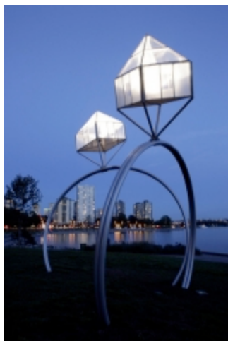
Engagement , by Dennis Oppenheim (USA).

Nightly: Join us at We, 2008 on Sunset Beach to view the light show in and amongst some of the most beautiful Vancouver Biennale sculptures.