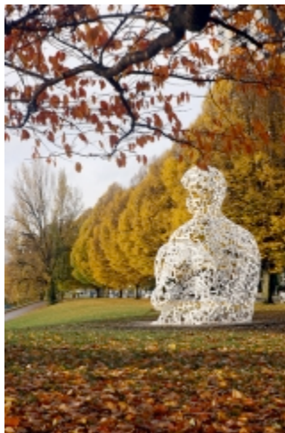
We, 2008 by Jaume Plensa (Spain).