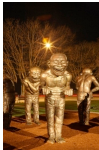
A-maze-ing Laughter , by Yue Minjun (China).