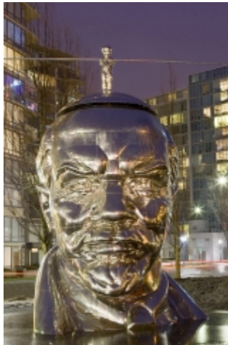
Miss Mao Trying to Poise Herself at the Top of Lenin's Head , by Gao Brothers (China).